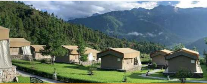
@4* Tiger Nest Luxury Camp, Paro