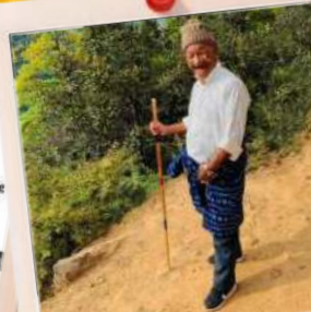
Hiking Stick at Tiger Nest 虎穴寺的登山杖