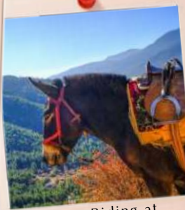
Horse Riding at Tiger Nest 骑马上虎穴寺