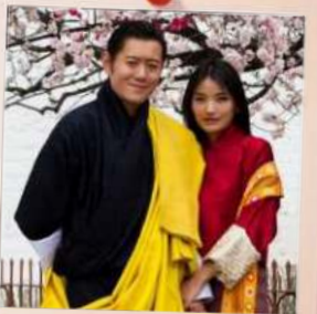
Bhutan Costume Experience 体验传统服装