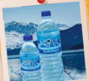
Unlimited Complimentary Water 无限量矿泉水