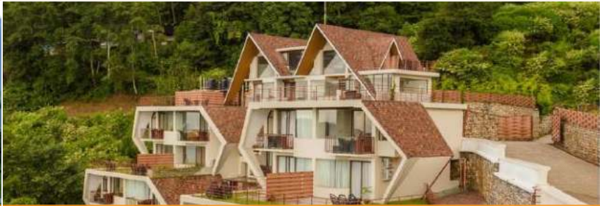
@4* Hotel Mystic Mountain, Nagarkot