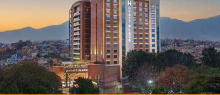
@5* Hyatt Place, Kathmandu