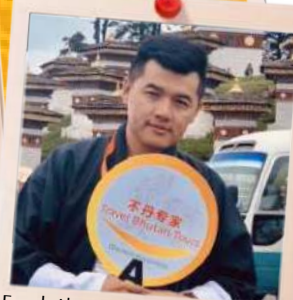
English, Chinese Speaking Guide 中英导游讲解