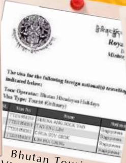
Bhutan Tourist Visa 不丹旅行签证