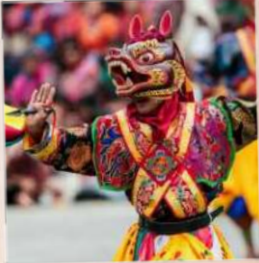
Bhutanese Cultural Dance 文化舞蹈表演