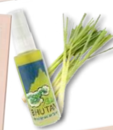
Organic Lemongrass Spray 天然香茅精油