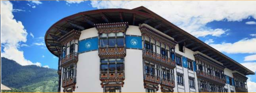
@5* DusitD2, Thimphu