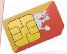
Local Data Sim Card 3GB 网络电话卡